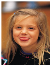
Not Being Respectful