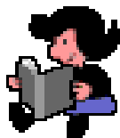
Do My Work