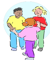
Get Along With Others