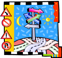
Not Following Directions