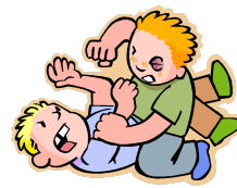
Not Getting Along With Others